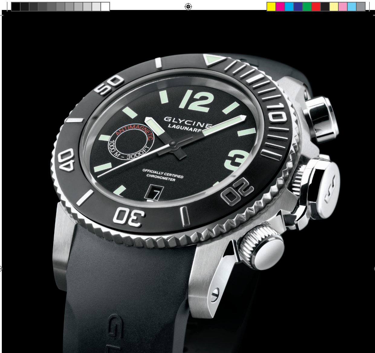
Model name with additional information about the model if necessary