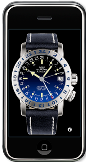
Front side indicating actual time and date and a 2nd timezone.